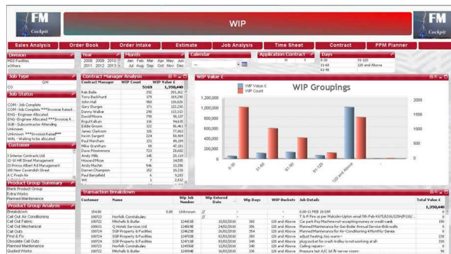
FM Cockpit – Work-in-Progress Analysis