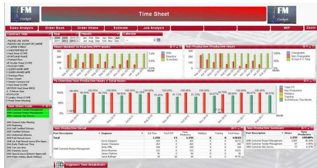
FM Cockpit – Time Sheet Analysis