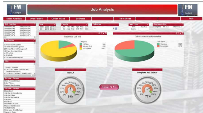
FM Cockpit – Job Analysis